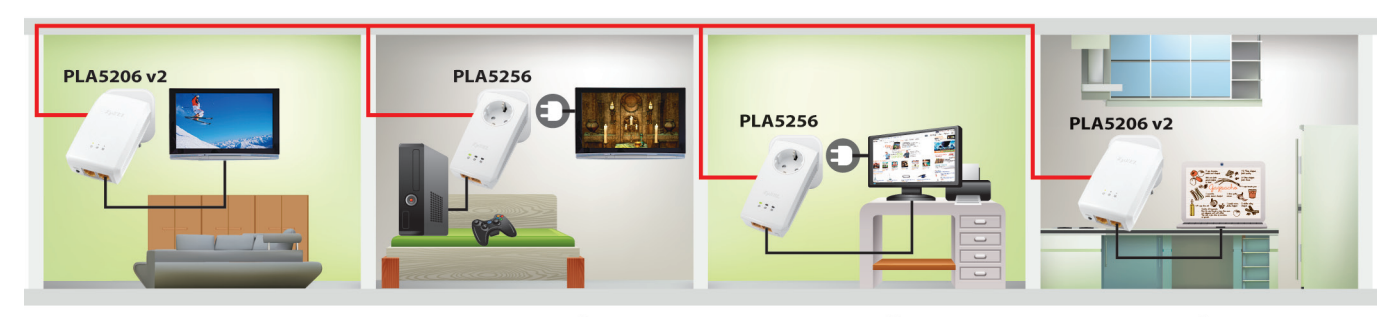
Music & TV Services Game Consoles Home Office Kitchen

Transform a power outlet into 2 Gigabit Ethernet ports for Internet routers, game consoles, smart TVs, and much more! Stream your 4K video contents reliably or play lag-free online games in the comforts of your living room with the ZyXEL's PLA5206 v2 Gigabit Ethernet Adapter. Simply connect one powerline Ethernet adapter to your Internet gateway/router and connect another powerline Ethernet adapter to a game console or networked set top box, it's that easy!