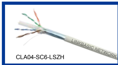
Cat 6 FTP solid cable RAL 7035