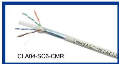
Cat 6 FTP solid cable RAL 7035