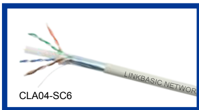
Cat 6 FTP solid cable RAL 7035