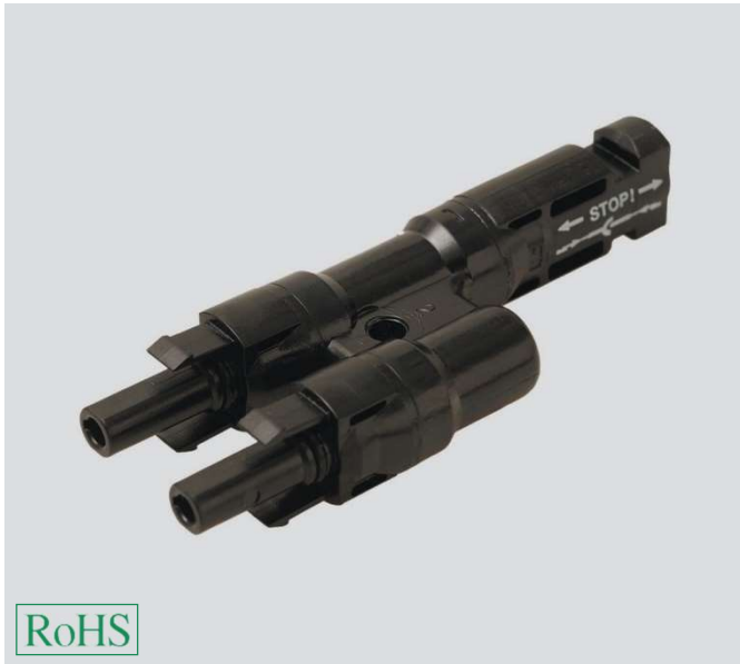
MC4 female branch connector