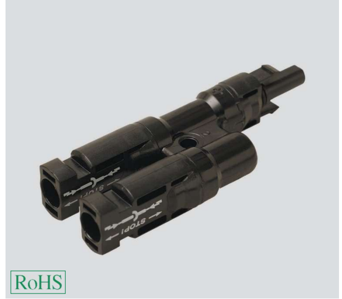
MC4 male branch connector